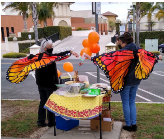
Kiwanis Monarch ladies used our facilities for their Poker Run and left us a nice donation.