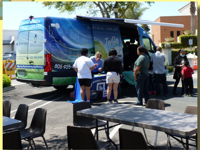
The SM Library Bookmobile was there