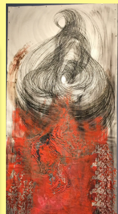
Big interesting painting, done using black ash & the fire retardant Phoschek.