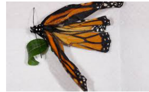
Butterfly with deformed wings