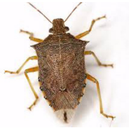
Spined Soldier Bug

Predatory Stink Bug Podisus maculiventris