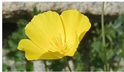
Parish's - parishii