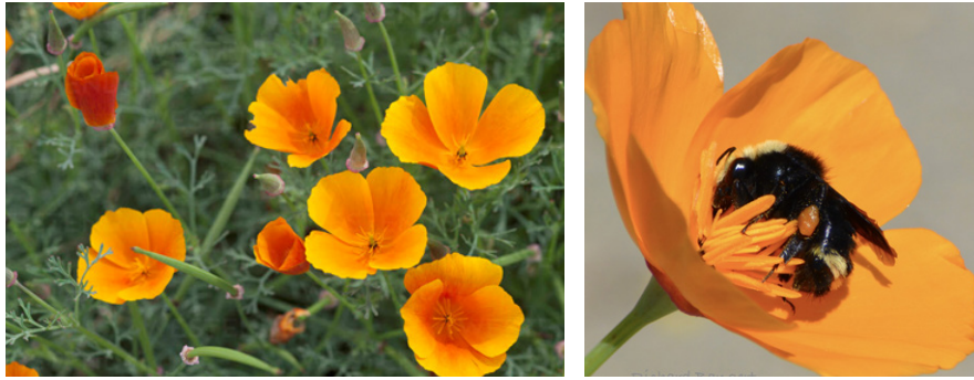
California Poppy - Eschscholzia californica

The California Poppy ( Eschscholzia californica ) is one of our most beloved wildflowers and is the state flower of California. It is native to the Pacific Slope of North America from Western Oregon to Baja California.