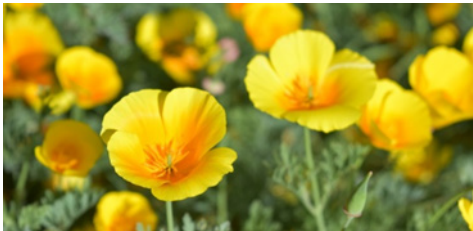
Coastal - maritima